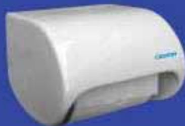
Toilet Paper Holder WOT 04 L145.0XW145.0XH110.0