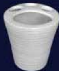
Toothbrush Holder WOH 01 W85.0 X H100 .0