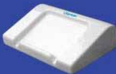
Soap Holder WOS 02 L105.0XW150.0XH45.0

*All dimensions are quoted in millimeters (mm)