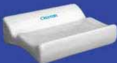
Soap Holder WOS 03 L110.0XW145.0XH45.0