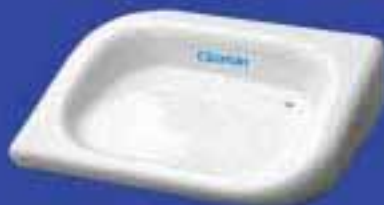
Soap Holder WOS 04 L110.0XW140.0XH45.0