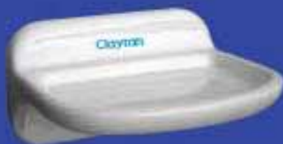
Dispenser Holder WOL 01 L130.0XW150.0XH85.0