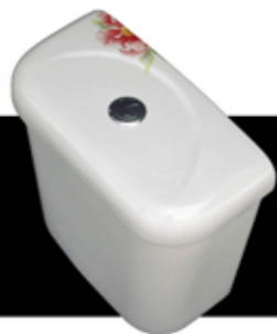
Cistern Lid With Decoration WOX 01