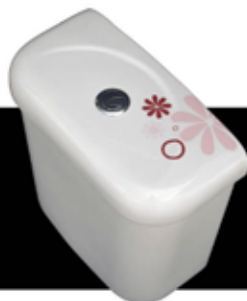
Cistern Lid With Decoration WOX 01