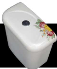
Cistern Lid With Decoration WOX 01