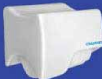
Toilet Paper Holder WOT 03 L135.0XW145.0XH125.0