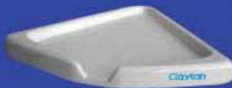
Dispenser Holder WOL 02 L105.0XW165.0XH35.0 WOL 03 L190.0 X W295.0 X H50.0