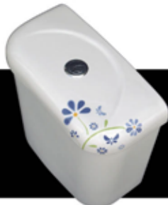
Cistern Lid With Decoration WOX 01