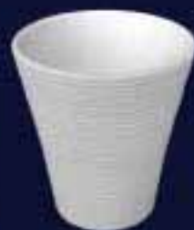
Toothbrush Holder WOB 01 W85.0 X H97.0

*Colour available: ■ white ■ black ■ honey ■ sorrento blue ■ nature