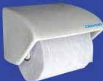
Toilet Paper Holder WOT 02 L130.0XW145.0XH105.0