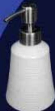
Soap Dispenser WOA 01 W85.0 X H164.0